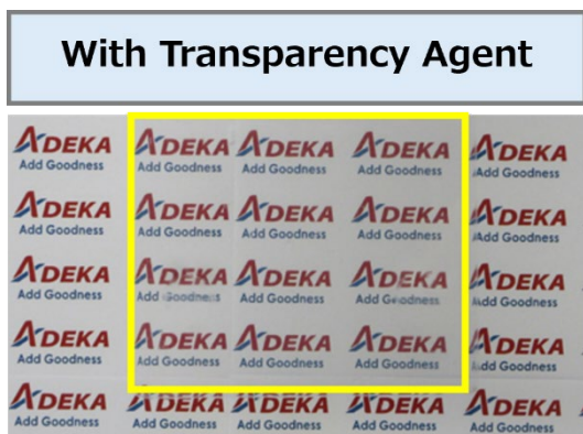
Test piece (1 mm) made of polypropylene with 0.1% TRANSPAREX

ADK TRANSPAREX™ CA Series embodies the ultimate transparency of polypropylene articles which are realized with significant lower clarifier dosage. The clarified polypropylene with TRANSPAREX™ is applicable for current applications including microwaveable transparent food containers, chemically resistant medical devices, and cosmetic packaging, etc., with best-in-class clarity and excellent physical and mechanical properties.