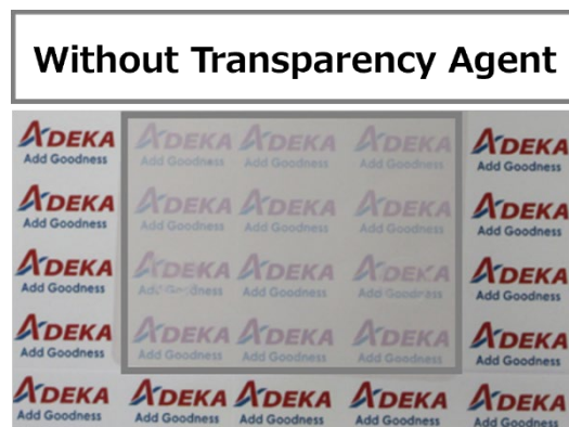
Polypropylene test piece (1 mm) without the addition of a clarifier